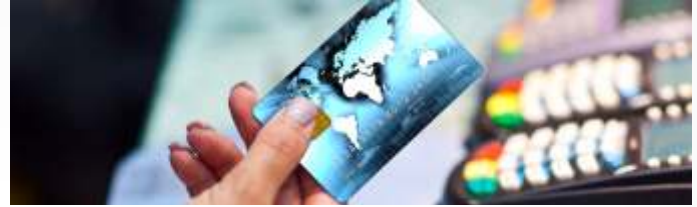
CARD MANAGEMENT SERVICES