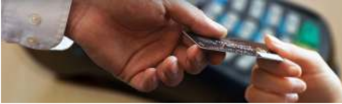
TRANSACTION PROCESSING SERVICES