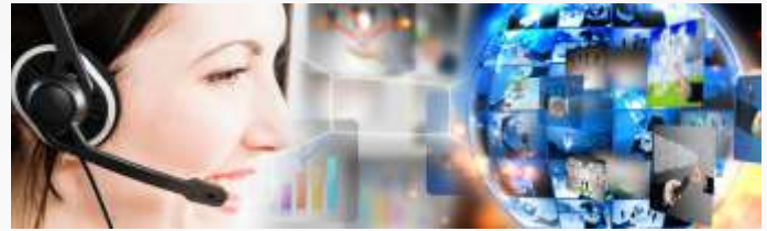
ATM MANAGED SERVICES CENTRE