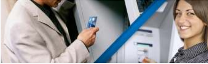
AUTOMATED TELLER MACHINE (ATM) OUTSOURCING SERVICES

Delivering Results, Reliability and Dependability Through Secure, Efficient Solutions & Services